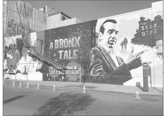
Bronx native Chazz Palminteri, A Bronx Story