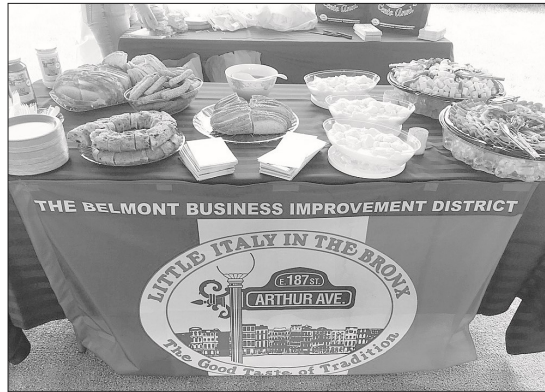
Little Italy in the Bronx

Little Italy in the Bronx Restaurant Week will run from Monday, February 3 to Thursday, February 13, 2020, when diners can enjoy a three-course, prix-fixe lunch for $20 and a three-course, prix-fixe dinner for $30 excluding gratuity, tax, and alcohol, or various value-added offerings at a variety of restaurants. Participants include NYC's best, authentic Italian restaurants, butchers,