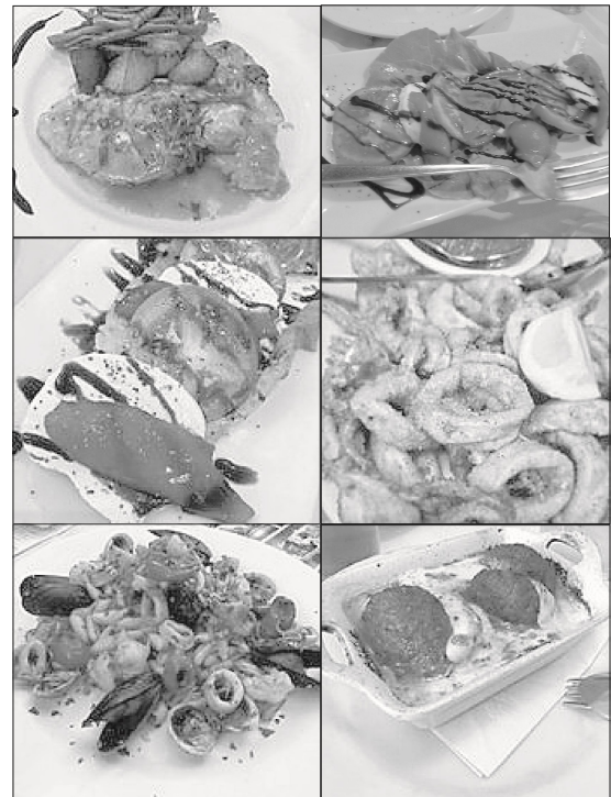
Great Italian Dishes

bakers, fish markets, delis, pastry shops, artisan shops and specialty stores. Local businesses are often owned and operated by the same families that founded them nearly a century ago. The offering is only valid during the week from Mondays to Thursdays. When making a reservation, please call the restaurant directly and mention Little Italy in the Bronx Restaurant Week.