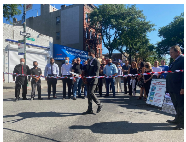
instead of 8' while the street is opened.

On July 9th, the Belmont BID was delighted to launch Piazza di Belmont, a glorious European-style outdoor dining experience. The BID wanted to implement this initiative as a way to best address and balance the needs of our retail and service stores while expanding seating capacity for our restaurants and eateries. This plan closes Arthur Avenue from East 188<sup>th</sup> Street to Crescent Avenue to vehicular traffic and parking from